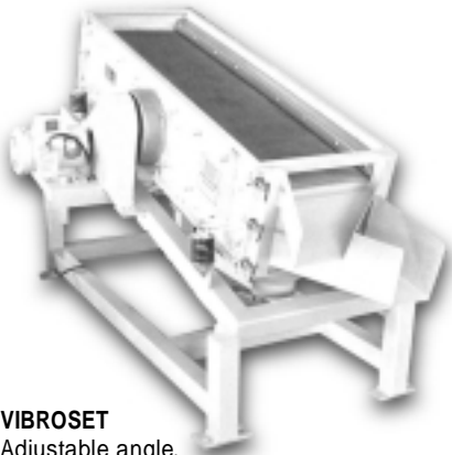
VIBROSET Adjustable angle, speed and stroke